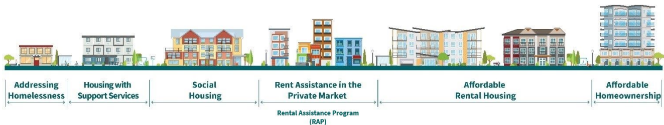
Figure 1: Housing Ecosystem

To increase choice, stability and quality of life for low-income working families by expanding the range of housing options and improving opportunities for continued independence. The Rental Assistance Program (RAP) is included in the suite of programs within the housing ecosystem (Figure 1). 1